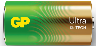
Model No.: GP14AU

This specification is applicable to GP Ultra Alkaline Cell, GP14AU (No mercury added).