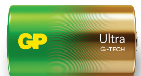
Model No.: GP13AU