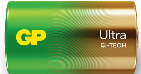
Model No.: GP13AU

This specification is applicable to GP Ultra Alkaline Cell, GP13AU (No mercury added).