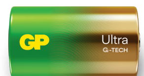
Model No.: GP13AU