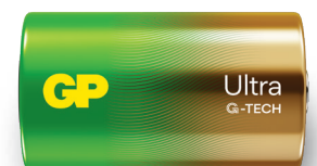
Model No.: GP13AU