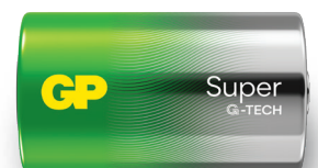
Model No.: GP13A

Note 3: AQL General Inspection level II, single sampling plan.