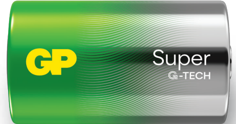
Model No.: GP13A

This specification is applicable to GP Super Alkaline Cell, GP13A (No mercury added).